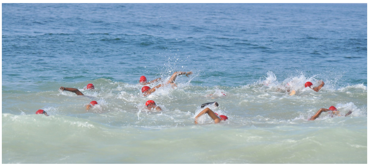
Above: Surf Swim for Open Men's Age Group

Overall championship – Tamilnadu with points of 565 Runner championship – Maharashtra with points of 280