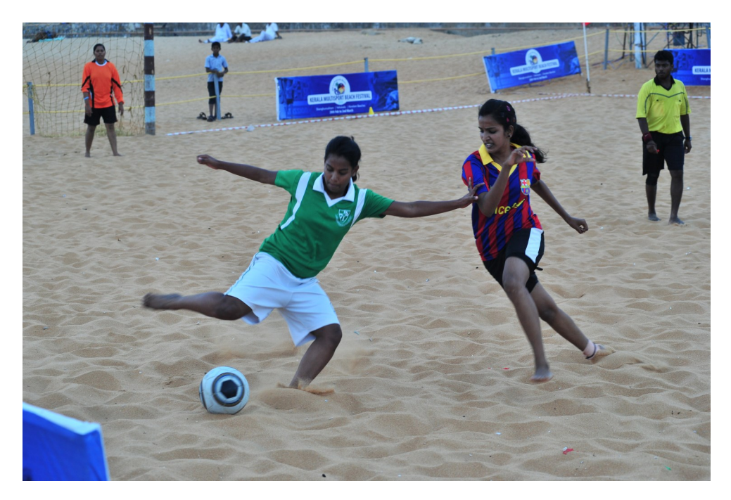
Above: Local Girls playing during the Women's Finals

BEACH VOLLEYBALL: (27<sup>th</sup> Feb to 2<sup>nd</sup> March 2014) Beach volleyball was organized by Trivandrum Olympic Association. National level and international level athletes pa ticipated in the event. Beach Volleyball was one of the attractions for spectators visiting festival.