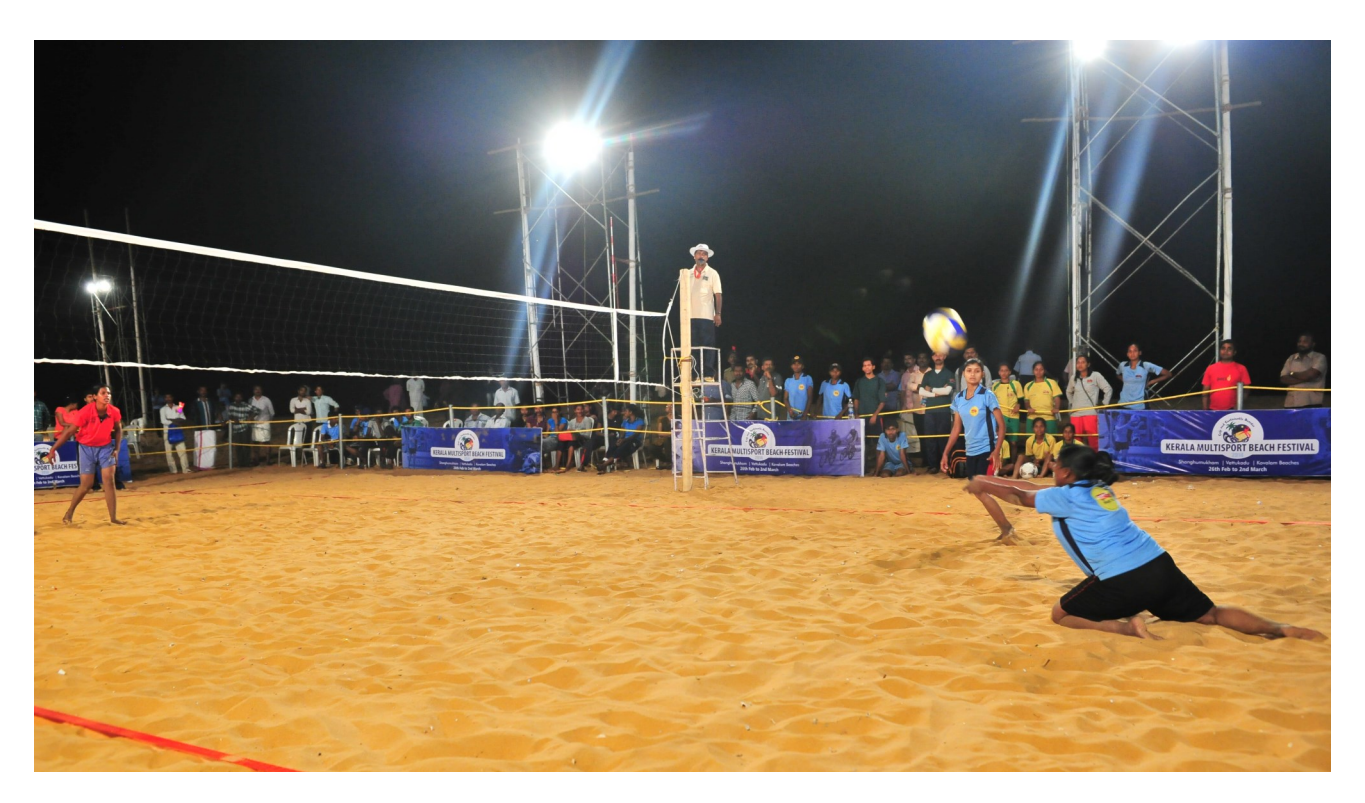
Above: Women's Beach Volleyball Semi Final's under lights

Directorate of Sports and Youth Affairs, Government of Kerala (DSYA) provided support for the promotions of the beach festival. Their contribution in allowing RLSSI to access the network of sporting agencies of Kerala through the Trivandrum District Olympic Association was noteworthy. Over 250 athletes from Kerala competed in the event. This was completely coordinated and arranged for by the Trivandrum District Olympic Association