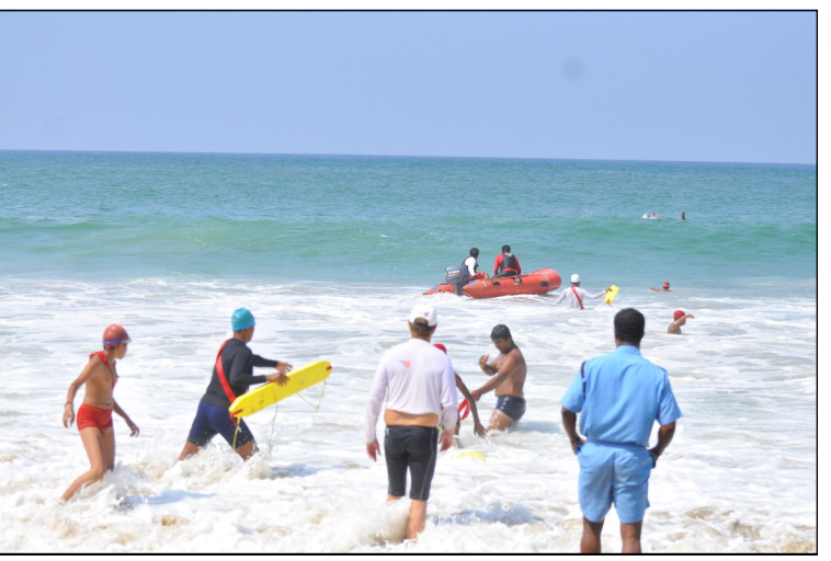
Above: RLSSI Water Safety overseeing the lifesaving

Most of Surf Life Saving's international work is undertaken in the Asia-Pacific region, not only due to geographical location, but also because of the aquatic environments within the region. Also, as the largest developed country within the Asia Pacific region, a great deal of responsibility to support developing countries lies with Australia.